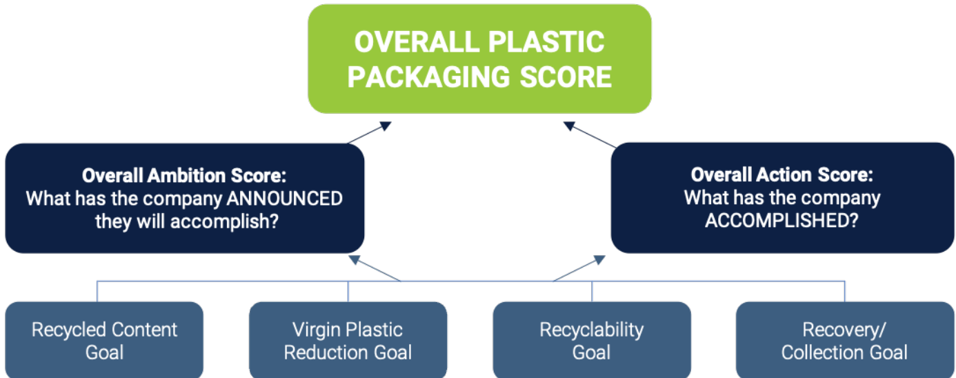
Figure 1. Components of the Plastic Packaging Score

Companies were classified by industry and each industry was categorized as a high, medium, or low plastic packaging user. The top 10 scoring companies in the high usage category are listed below.