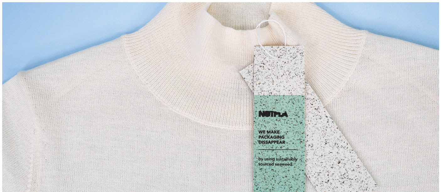
Edible and biodegradable packaging from seaweed by Notpla

Since many companies have set their goals relatively recently, more ambition has been reported while fewer companies have reported progress toward their goals. As we get closer to the target year and companies report more achievements, we hope to see more differentiation between Sustainability Leaders that are reaching and exceeding their goals from those merely making empty promises. As the report, and these plastic packaging goals, evolves, the criteria for being a Sustainability Leader will become more stringent to show those truly taking strides to improve their environmental performance.