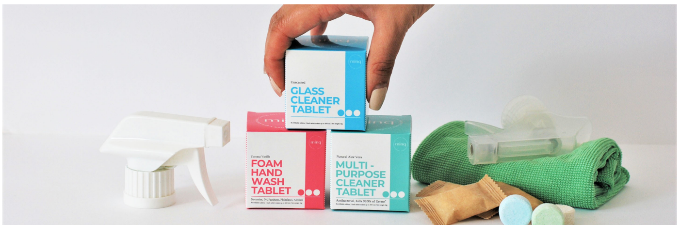
Eco-friendly cleaning tablets by minq

Many reports about plastic have been published that call out the largest polluters or show the extent of the plastic pollution crisis, but these reports do not compare end-user corporations in a quantifiable way. The aim of this report is to create a benchmarking system by which companies can analyze their performance using a measurable, actionable score. With this in mind, Ubuntuo partnered with Brandscapes Worldwide, a global insights and data analytics company, to compare the stated plastic packaging goals of companies against their actual progress toward these goals. This report looks at how 176 global companies with annual revenues above 1 billion USD are faring against their targets.